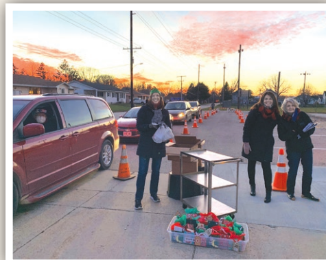
Perfect December Night