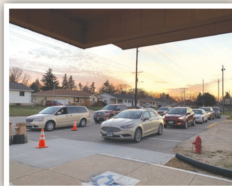
Waiting in Line