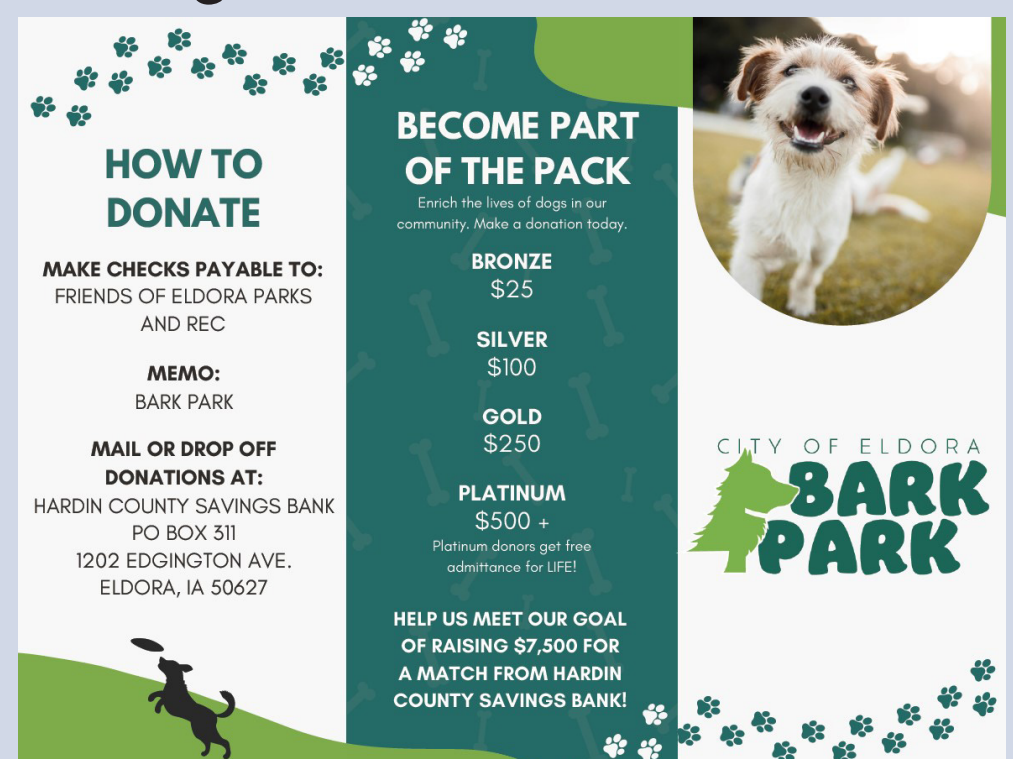
Fundraising for the City of Eldora Bark Park has begun, and the Hardin County Savings Bank has pledged to match up to $7500 in donations.